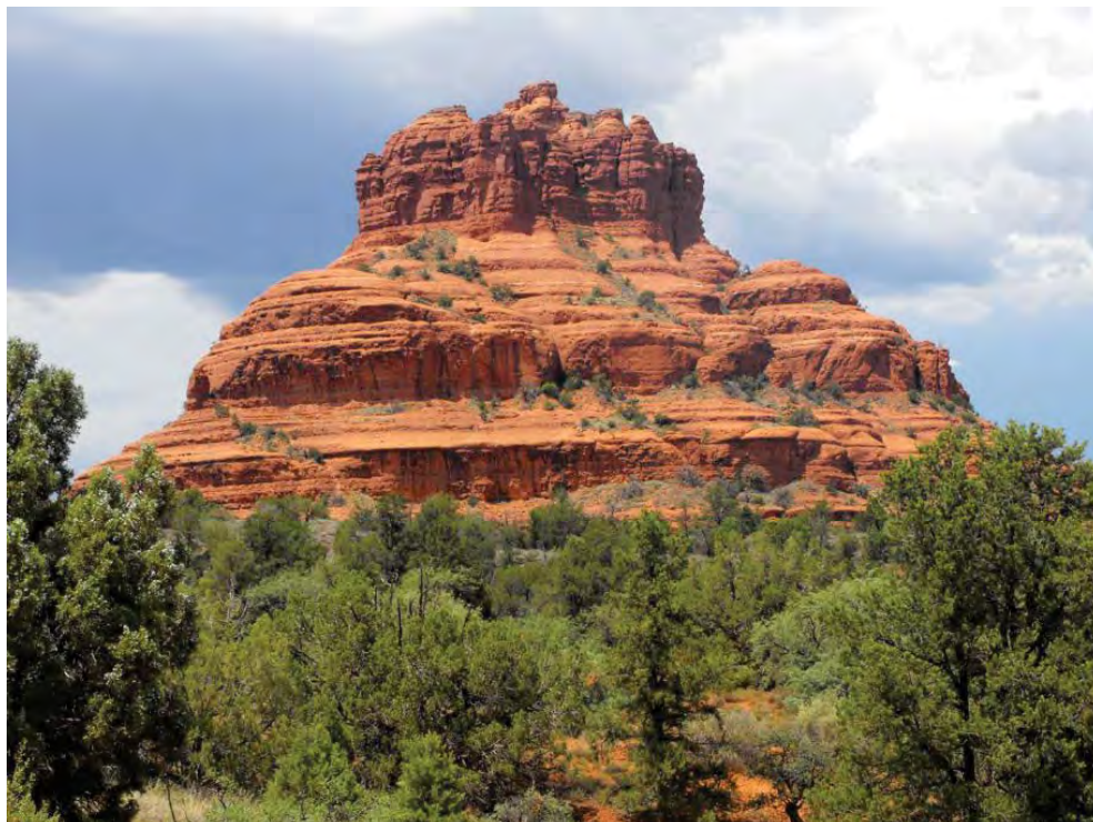
BELL ROCK, ARIZONA

119th Annual IMSA International Conference and 37th Annual School, July 22 -25 & 26-29, 2014 at the Renaissance Hotel in Schaumburg, Illinois.